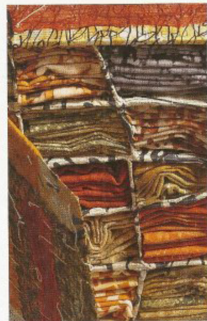
Top: Tsila Goldstein/IL, „Honnete Femme“, 2011, 40 x 50 cm, scorched cotton, collage