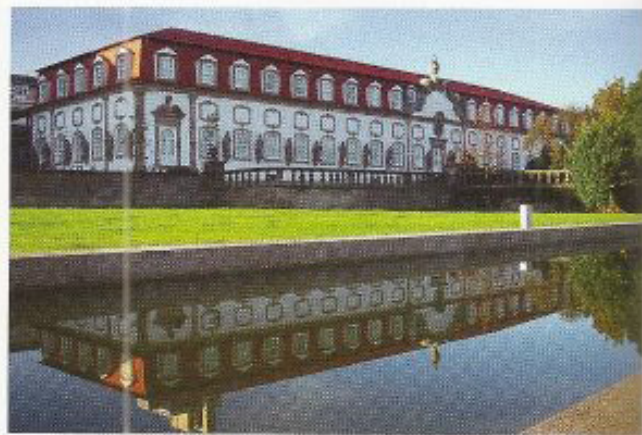
Vila Flor, venue of the conference