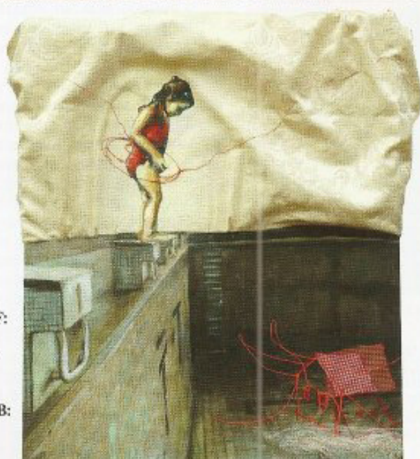
▲ Sarah Perret/F: „The Land of the Mist“, 2010, 200 x 140 cm, tapestry