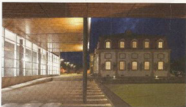
Cultural Centre Vila Flor in Guimarães